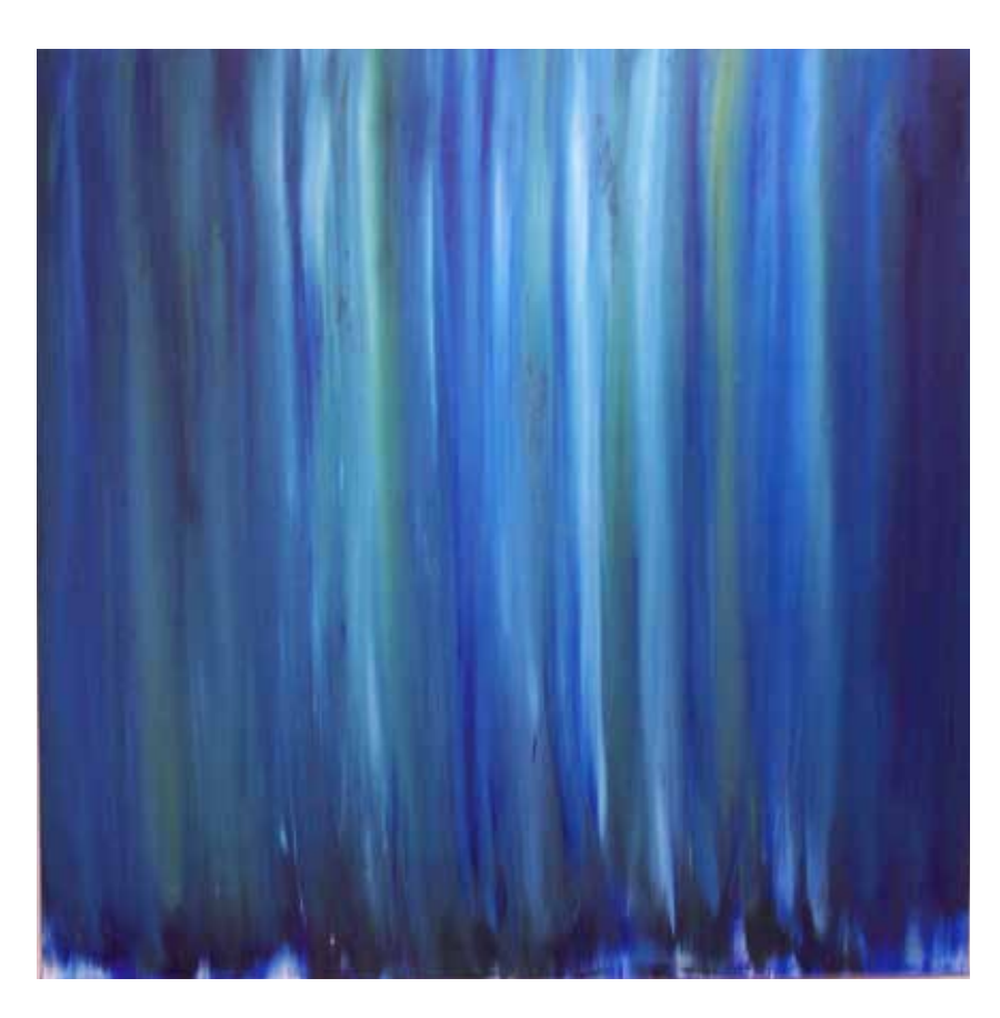
Exhale No. 2 Mindy Hay