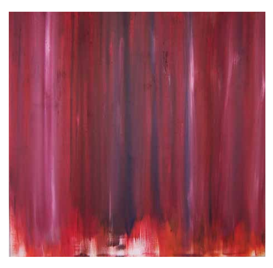
Inhale No. 2 Mindy Hay