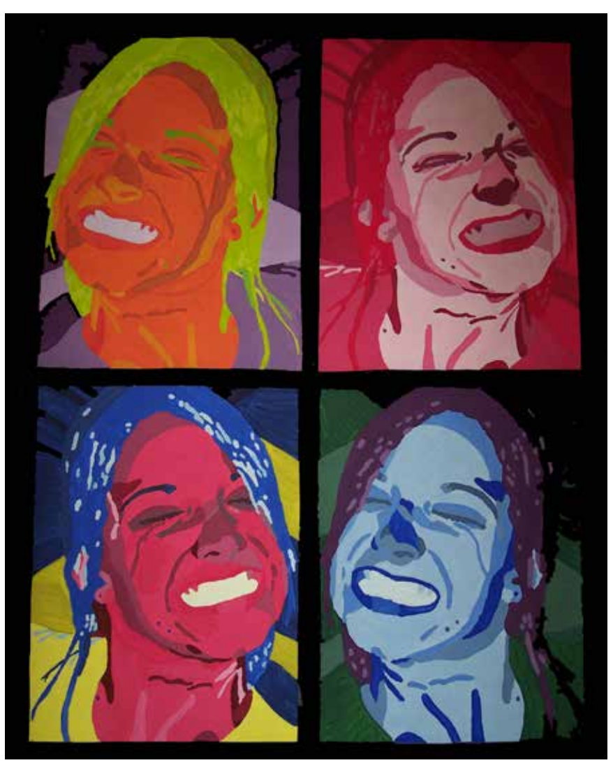
Untitled Kristen Flahive