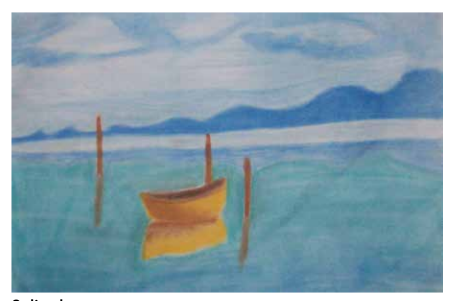
Solitude Heather Fielden