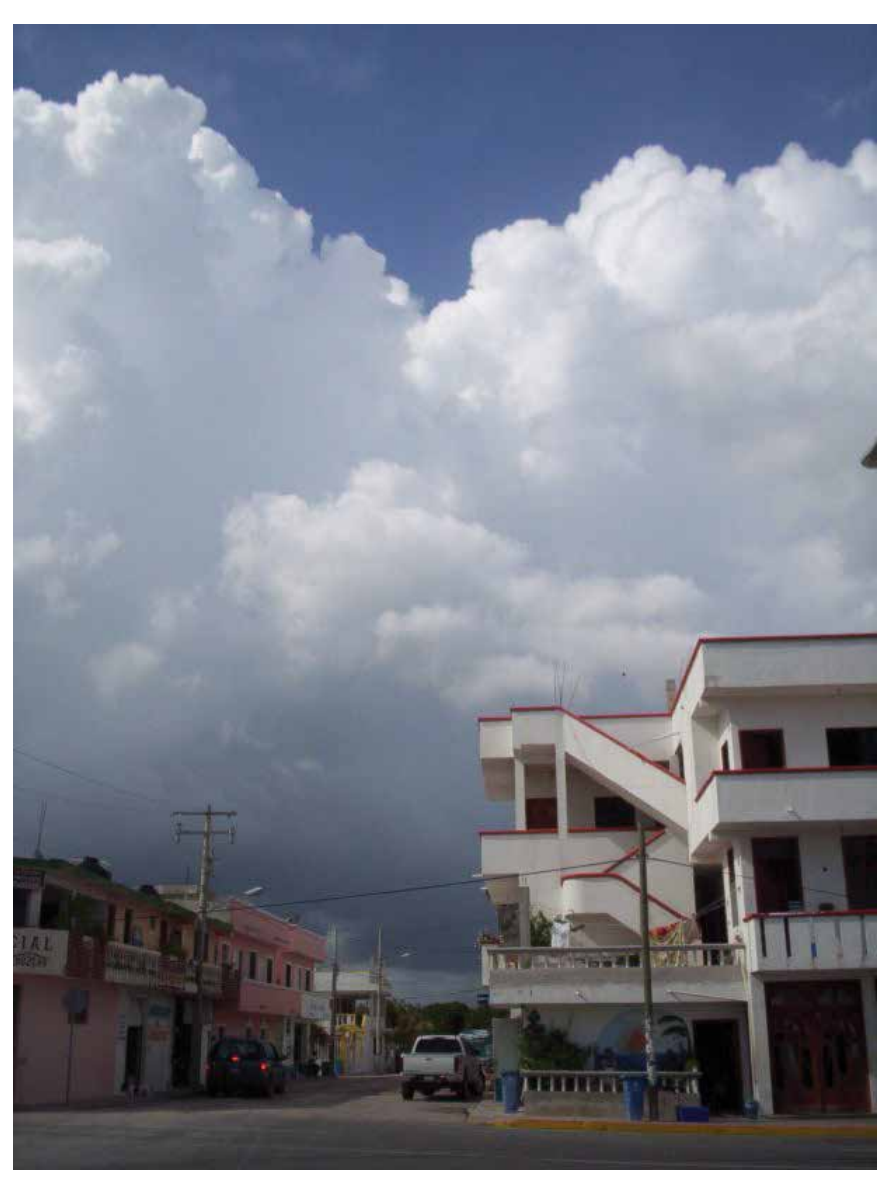
After The Rain...Mexico Village Audra Glenn