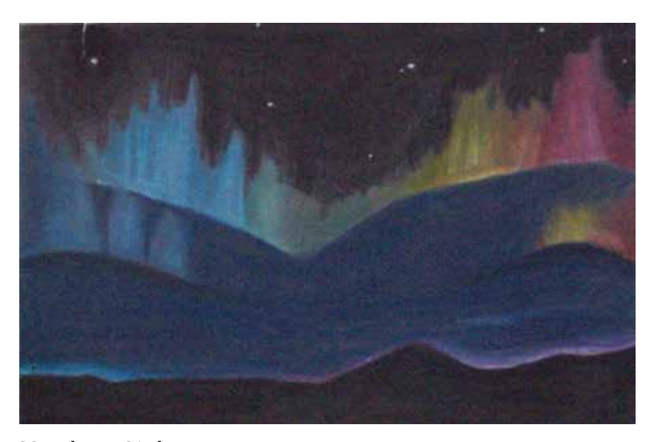
Northern Lights Heather Fielden